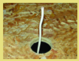
Figure 3 - Pull romex through floor.